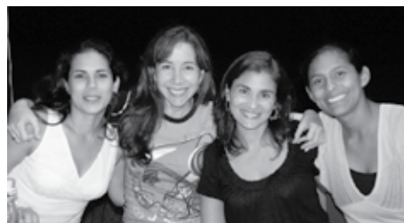
Comité de recepción