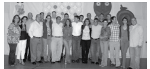
Class of 1979

band "Los Paisaleños" made everybody sing along.