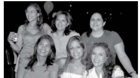
Class of 1989

Everything was set up for the first show of the night: "Show Tropical". Danzartes blew us away with this first show and made everybody stand up. Afterwards, the live