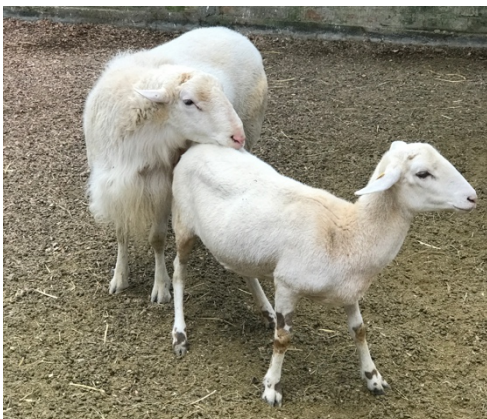
Figure 5.1 Katahdin Breed (Aristizábal,2016)

develop bigger body physiology due to its genetics. In order to have a better production, these breeds are crossed with milk production ones (Male-meat breed, female-milk breed), maintaining their physical traits for the newborn with a high milk production ewe. Due to their genetics, pure animals from breeds like Dorper and Charollais have a low production of milk compared to others. That is why it is crossed with the Katahdin breed, maintaining an ewe with high milk production and a newborn with the physical characteristics of Dorper or Charollais. (Aristizábal, 2016)