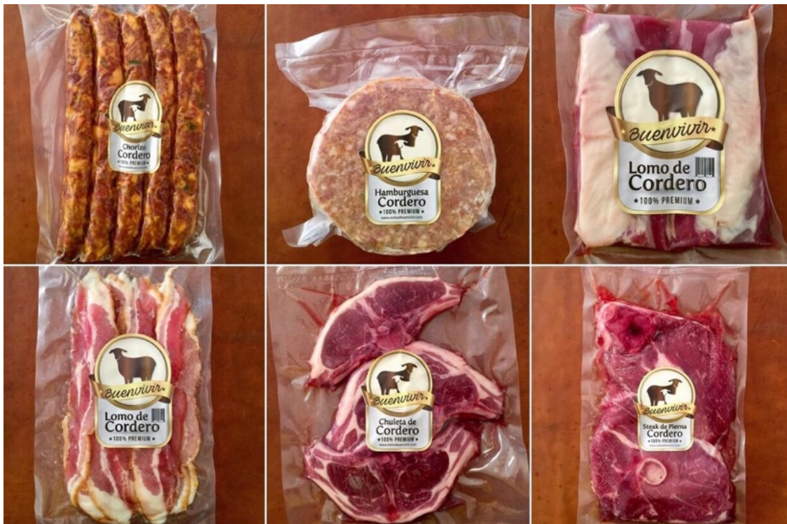
Figure 6.3: Lamb Products by Ovinos Buenvivir (Aristizábal, 2016.)

The meat marketing has been very difficult, due to the small market created by the culture and high price of the product. Ovinos Buenvivir has started to open this new market by selling their products to friends and family. We have also participated in small events, like the Colegio Bolívar Farmers Market, but the commercialization has mainly expanded by word of mouth. Usually selling our products to restaurants and butcher shops has been difficult as a result of the production rate and the price.