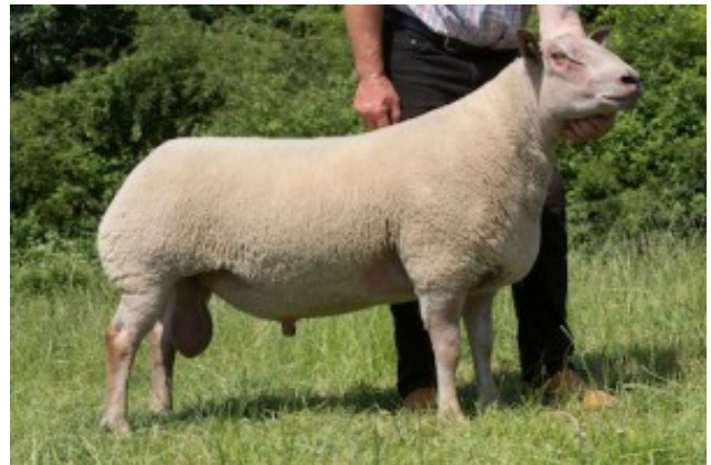
Figure 5.2: Charollais Breed (Farmers Weekly, n.d.)