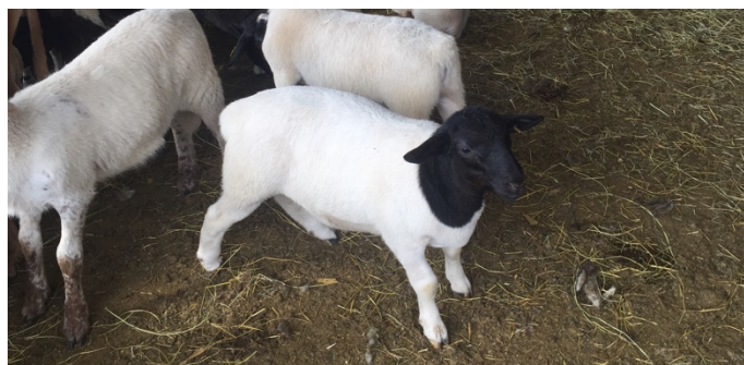
Figure 5.3: Dorper Breed (Aristizábal, 2016.)