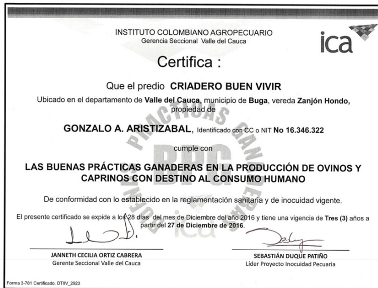
Figure 6.2: I.C.A Certificate for Good Cattle Practice in the Production of Sheep & Goats for Human Consumption (Aristizábal, 2016.)

Currently, the farm is in the process of reaching the break-even ( punto de equilibrio ) business point (where there is no loss or gain in profit). This point is estimated to be reached when the farm has about 150-200 female sheep. At the end of 2016, there we reached the 100-female sheep, and the projection on reaching the 150-female sheep is estimated to be at the end of 2017. Also, the farm currently produces around 2-5 lamb per month, but the processing of these may vary depending on the demand.