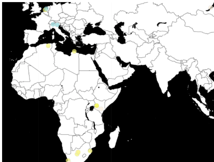
Figure 1.2: Location of Fossil Records. (Czaplewski, 2016)

Fossils from this species have only been found in Europe, Africa and Asia ( Figure 1.1 , below). Most of these were found in South Africa, but as well, fossils were found in Kenya, Algeria, and Libya. The time period estimated of these fossils is about 66 million years. Where these are located in the Phanerozoic era, and to be more precise in the Quaternary and Cenozoic era. The blue points in the map ( Figure 1.1 ) reflect the fossils found from the Phanerozoic era, and the yellow reflect the ones found from the Cenozoic era. In addition, many of these fossils were found in caves, but as well they were found in coastal, eolian, fluvial-lacustrine places. On the other hand, the fossils found in Europe were located in the north and the south of the continent. Near the Netherlands and Italy, fossils were also found in caves. Looking at the displacement of sheep, a theory states that sheep come from the south of Africa that later migrated into Europe and Asia. However, there is a more precise theory, stating that Ovis aries had two main beginnings. One of them, in central part of Europe and the other in the south part of Africa, generating this species to have different characteristics (Czaplewski, 2016).